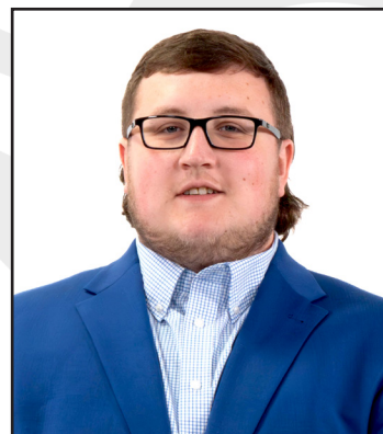
CASEY KNIGHTEN MEDIA GUIDE PHOTOGRAPHER